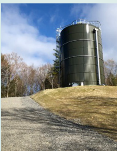
New 130,000 gallon glass fused steel Drummer Hill Water Tank.