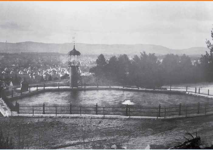
The Octagon Reservoir was constructed in City Park on Beech Hill in 1886