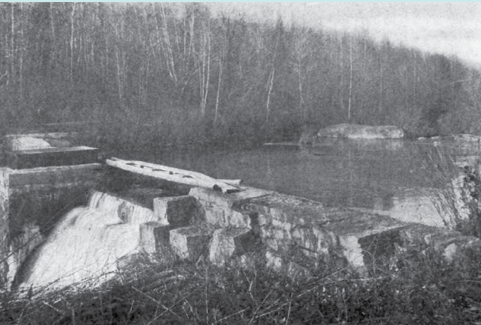
Intercepting Dam No. 1 Roaring Brook (Quarry Dam) 1886