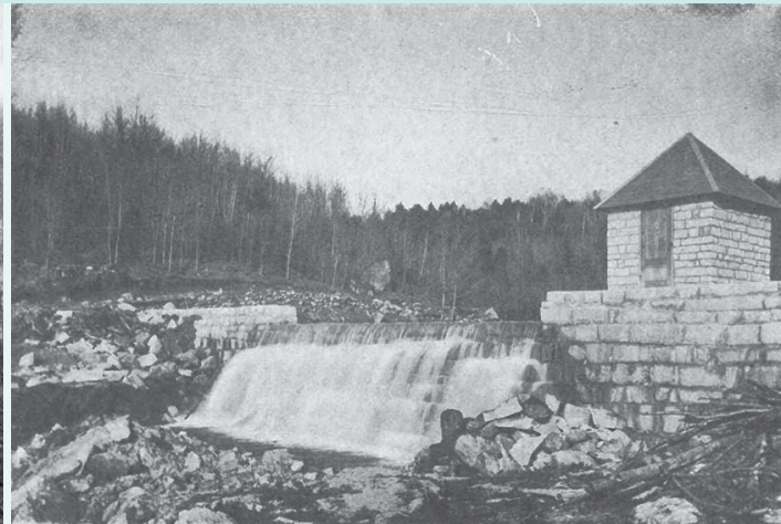
Intercepting Dam No. 2 Roaring Brook (Stone Dam) 1902