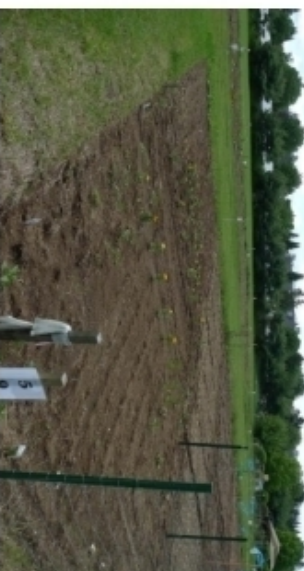
Keene community gardens

- Problem solving efforts for local farmers and the farmer's market