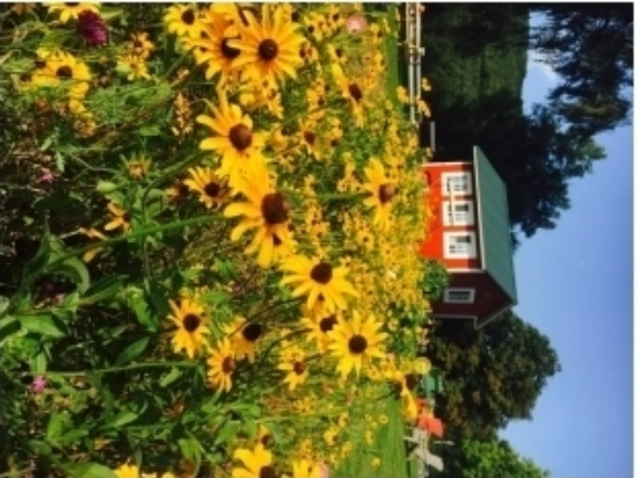
Milflowers and seasonal farmstead at Dusty Dog Farm