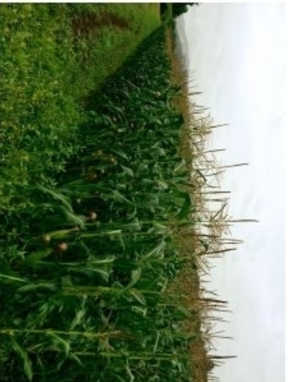
Corn field at Green Wagon Farm