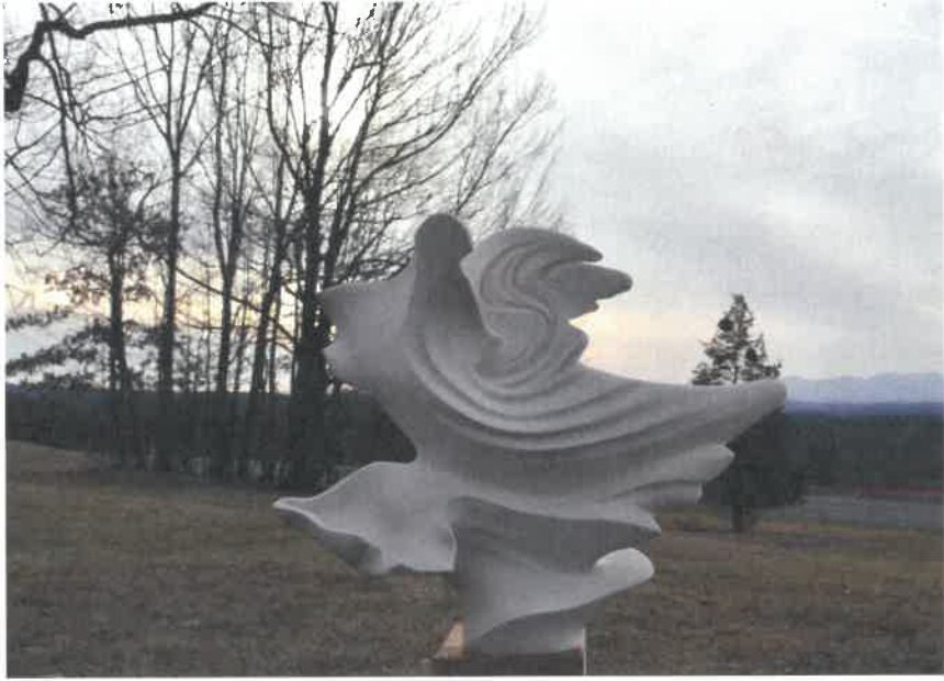
2. Image of the Schepker sculpture: