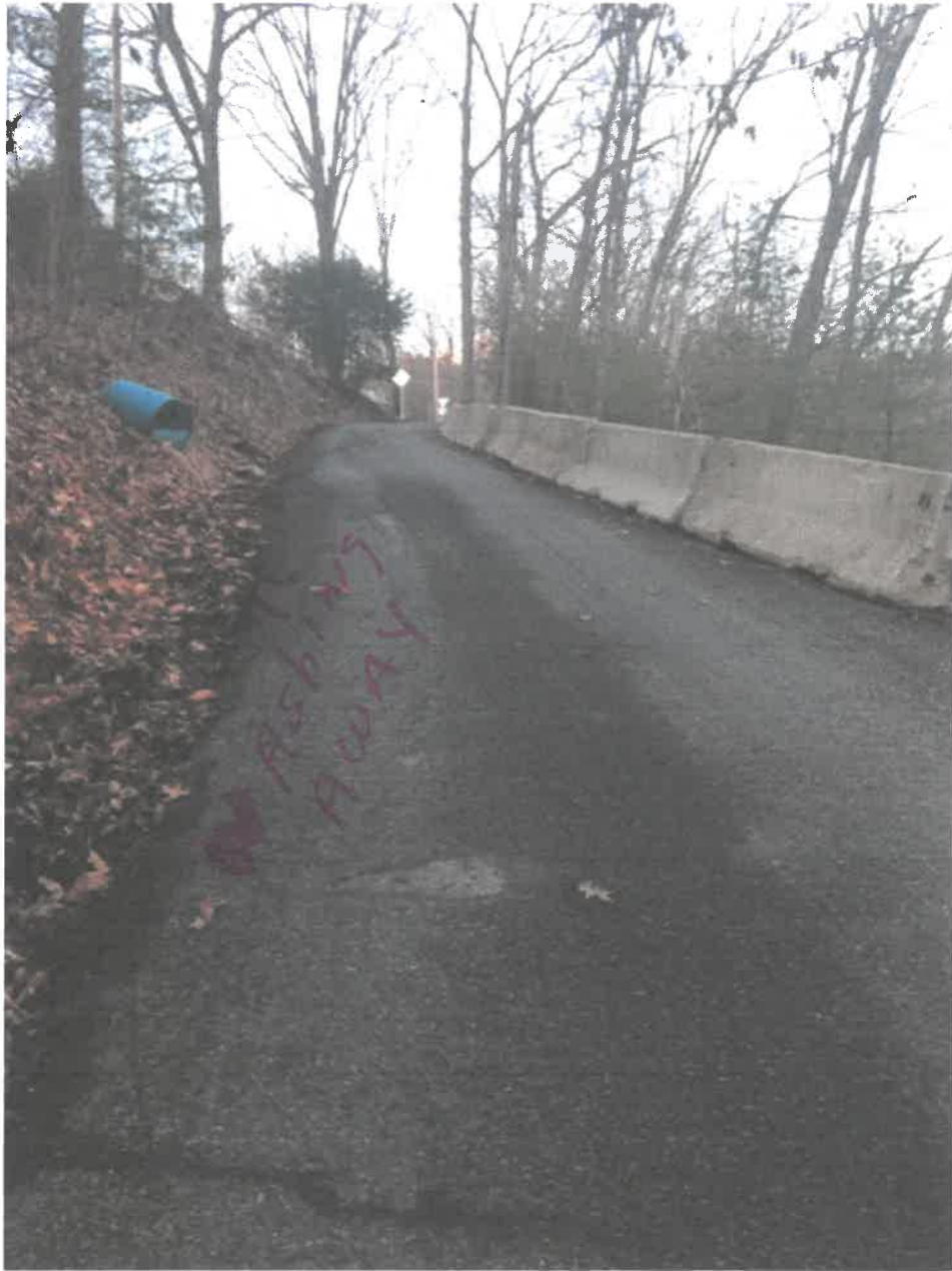
Looking up the hill At Jersey BARRIERS