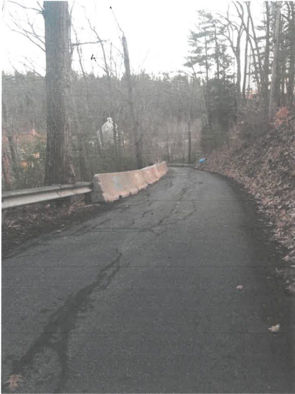
Looking down the hill at Jersey Barriers