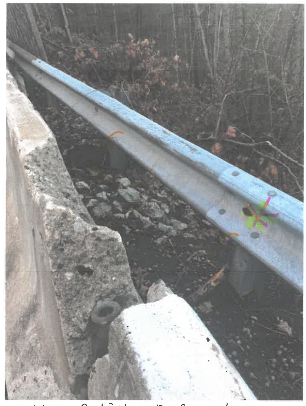
Middle of hill - Behind barriers Guardkark not into ground