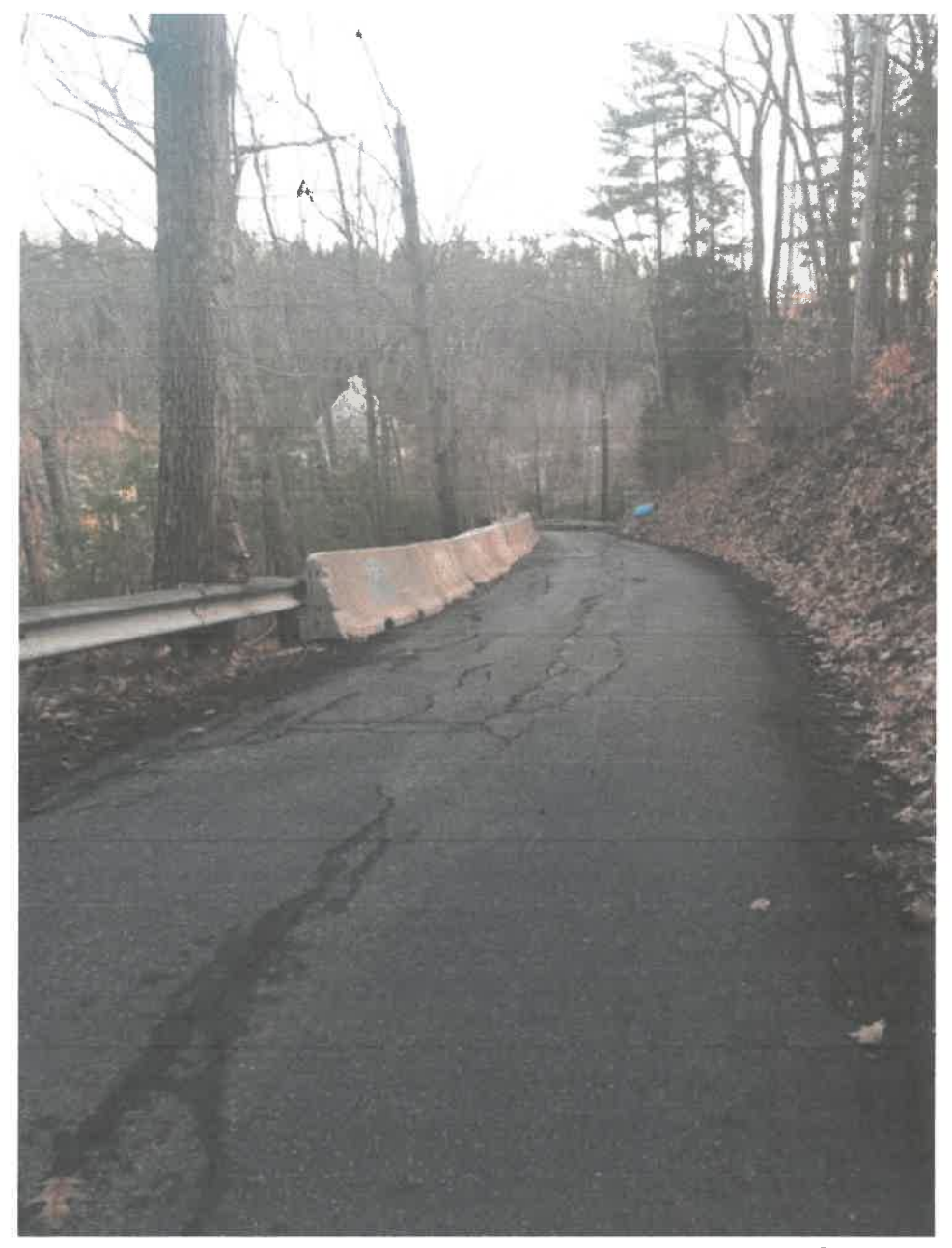
Looking downthe hill At Gersey BARRIETS