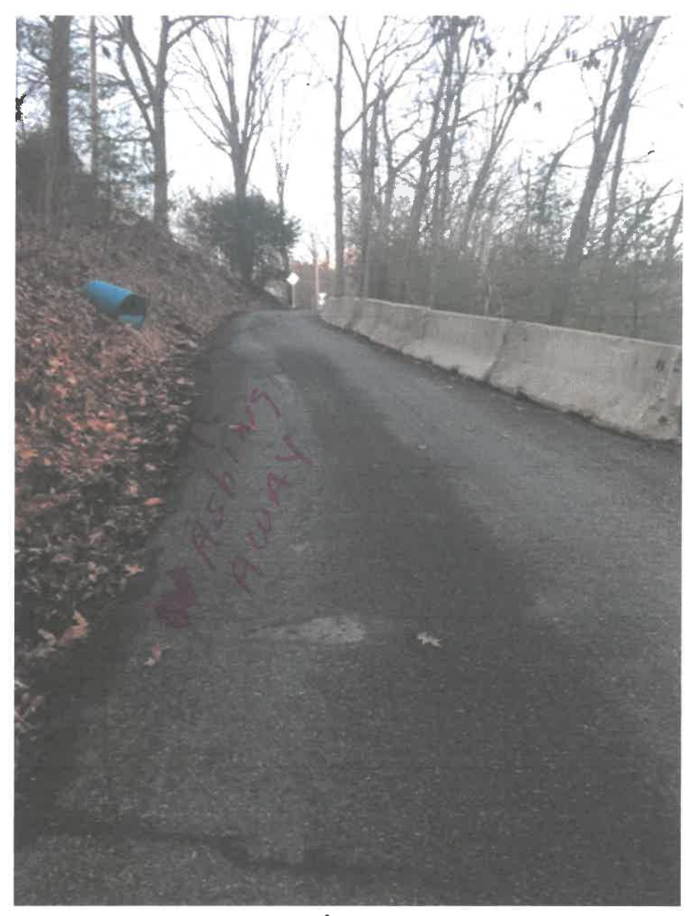
Looking up the hill At Gersey BAKKIERS