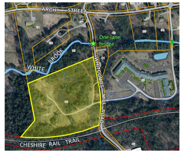
Figure 1. Aerial image showing the 19 Whitcombs Mill Road property, highlighted in yellow.

The 19 Whitcombs Mill property is currently vacant land with a mix of forested and cleared gravel areas. The property has 764 feet of frontage on Whitcombs Mill Road. White Brook runs west to east immediately to the north of this parcel, and a portion of the site along the northern property boundary is located