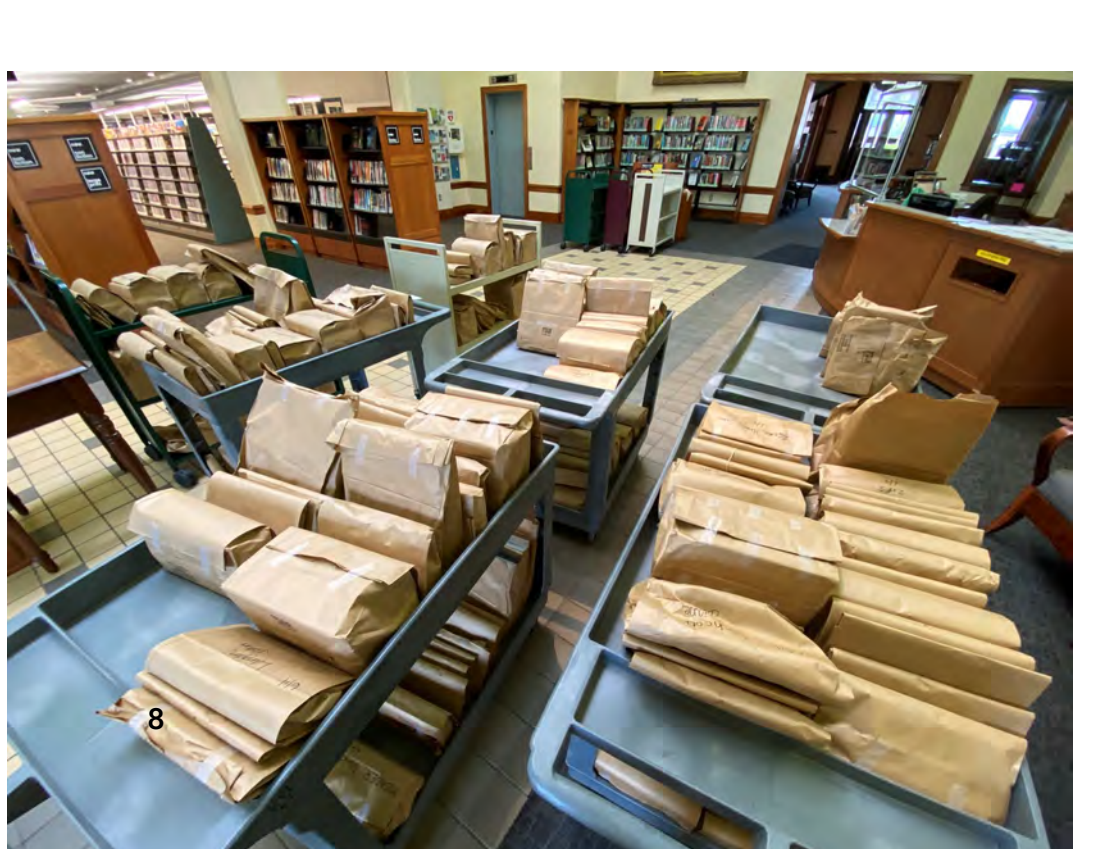
Outgoing materials for curbside service in the months we were closed during the pandemic

Share interview responses with other governmental departments and non-governmental agencies for their planning purposes (Planning/Zoning, Public Works, City Council, Planning Board, Southwest Regional Planning, Home Healthcare Hospice and Community Services, etc.)