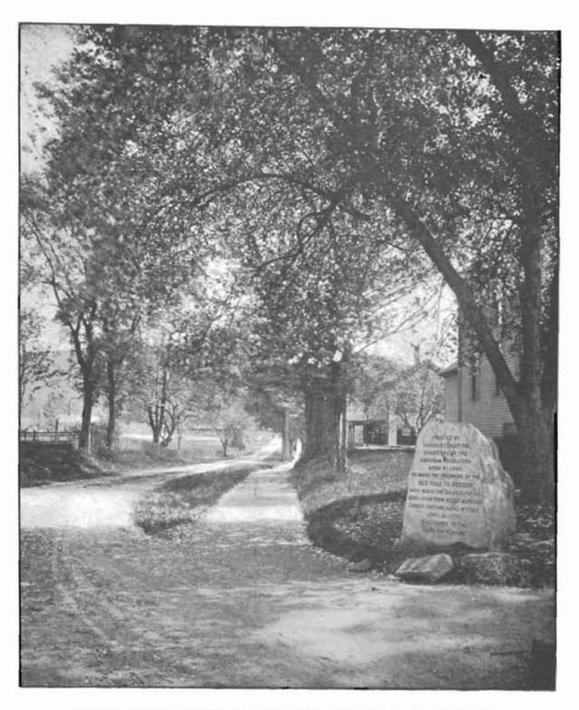
BOSTON ROAD, NOW BAKER STREET. WITH D. A. R. MARKER.