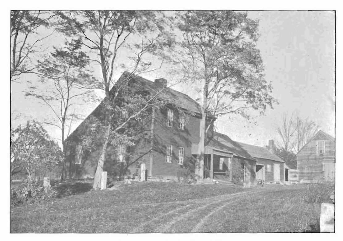
LUTHER NURSE HOUSE. BUILT 1773.