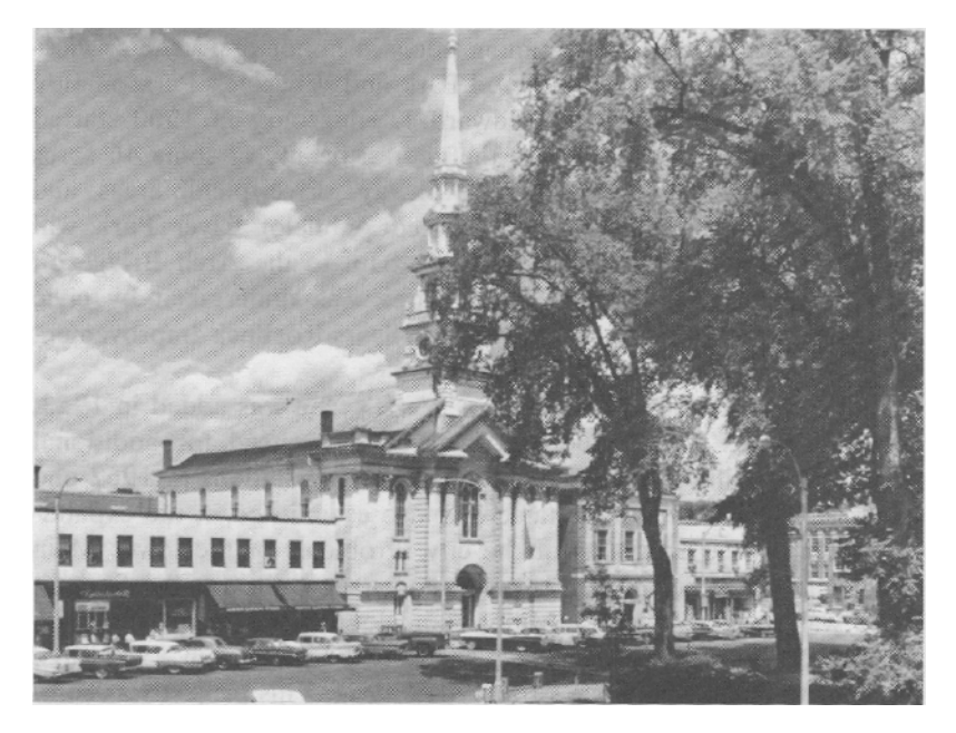
Central Square in the 1960's

In 1960, when Keene's population stood at 17,527, a traffic circulation study was submitted by the Keene City Planning Board and