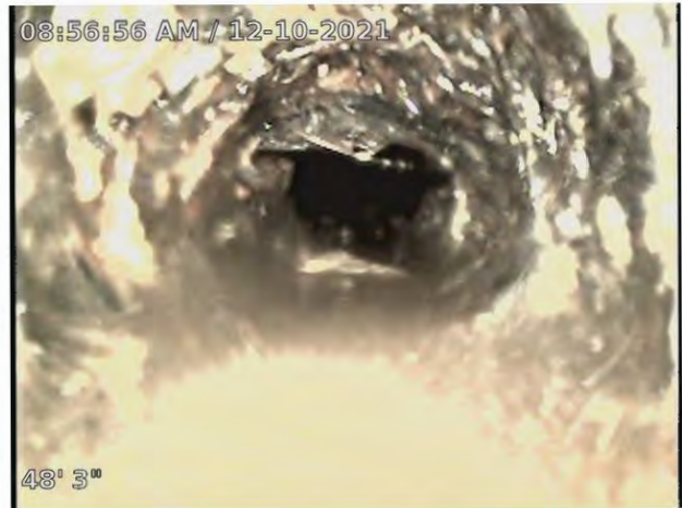
Interior of Pipe