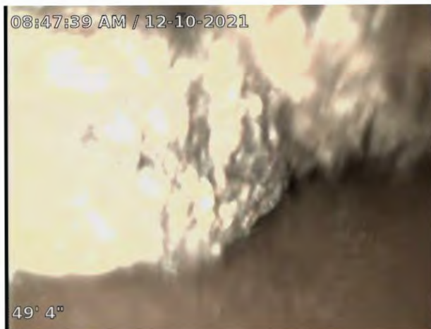
Interior of Pipe