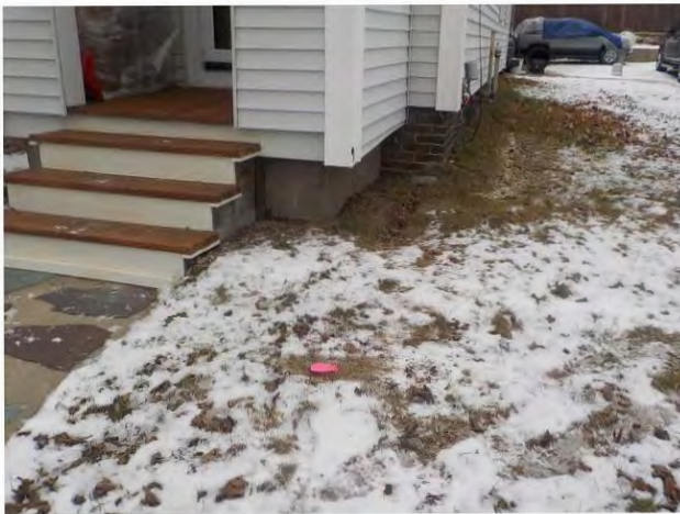
Area Where Camera Stopped