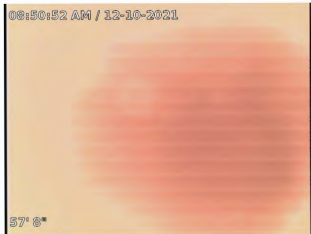
Area of Blockage