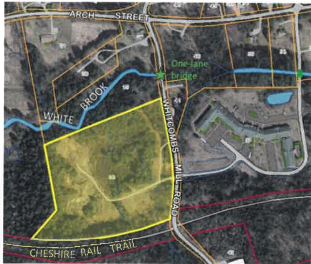
Figure 1. Aerial image showing the 19 Whitcombs Mill Road property, highlighted in yellow.

The subject property has access to City sewer via an easement on the Langdon Place of Keene property located at 136 Arch Street. This 50-foot wide utility easement runs from Whitcombs Mill Road across the Langdon Place of Keene property, crosses White Brook, and connects to Arch Street. In order to connect to City sewer, the owner or developer would need to pay to extend the sewer line from Arch Street to the site. City water is located about 0.1 miles from the property at Arch Street/Felt Road, or it could be accessed