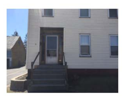
31 Dunbar Street Three-Family - 3,484 SF Lot