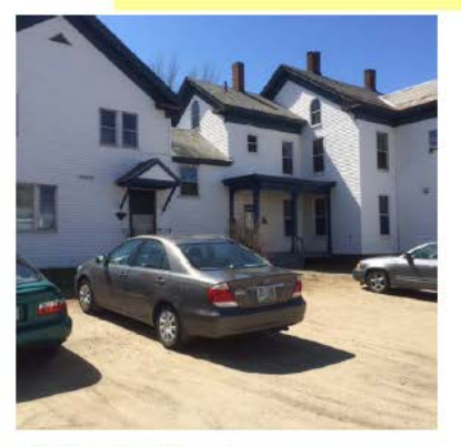
19 Dunbar Street 4-8 Unit Apartments – 8,494 SF Lot