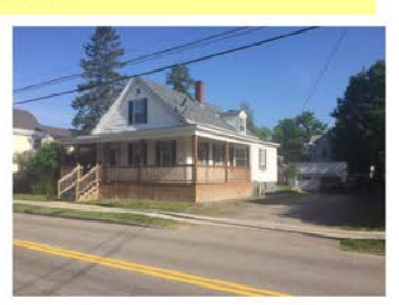
42 Water Street - Single Family