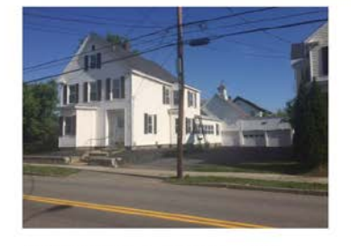
26 Water Street – Boarding House