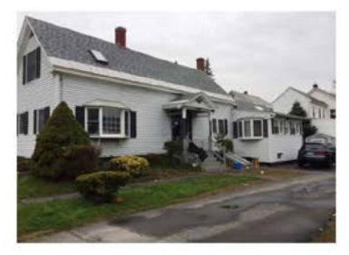
68 Water Street – Three Family

54-56 & 60 Water Street – Two & Single Family