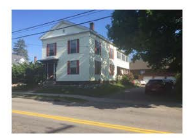
48 Water Street - Three Family