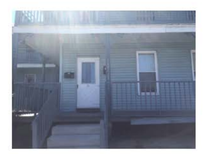
41 -45 Dunbar Street 4-8 Unit Apartment – 11,325 SF Lot