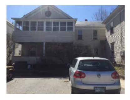
57 Dunbar Street 5-Unit used as 4-Unit, 8,712 SF Lot