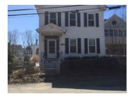
65 Dunbar Street Two-Family – 8,276 SF Lot