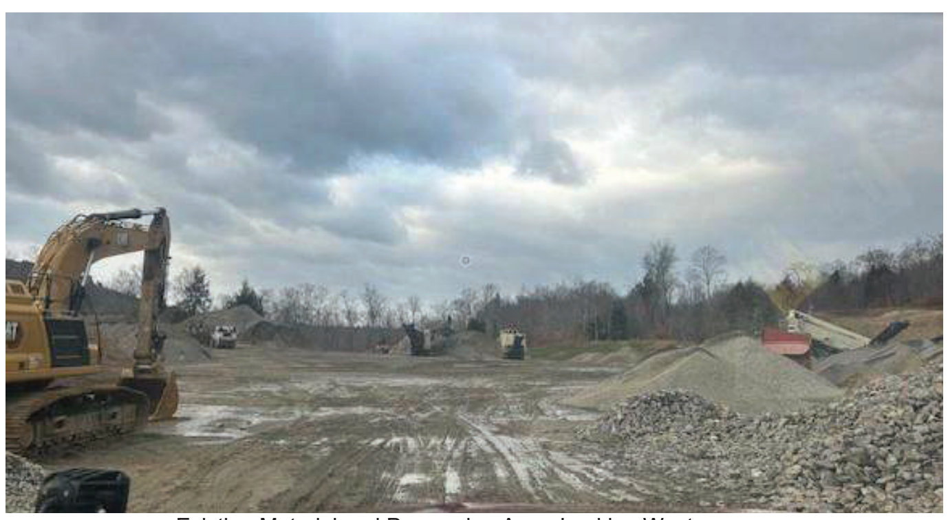
Existing Material and Processing Area, Looking West December 12, 2024