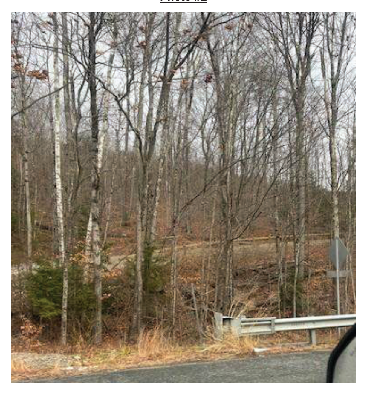
Existing Access Road from NH Route 9, Looking North December 12, 2024