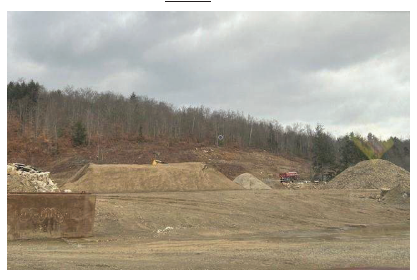
Existing Material and Processing Area, Looking North December 12, 2024