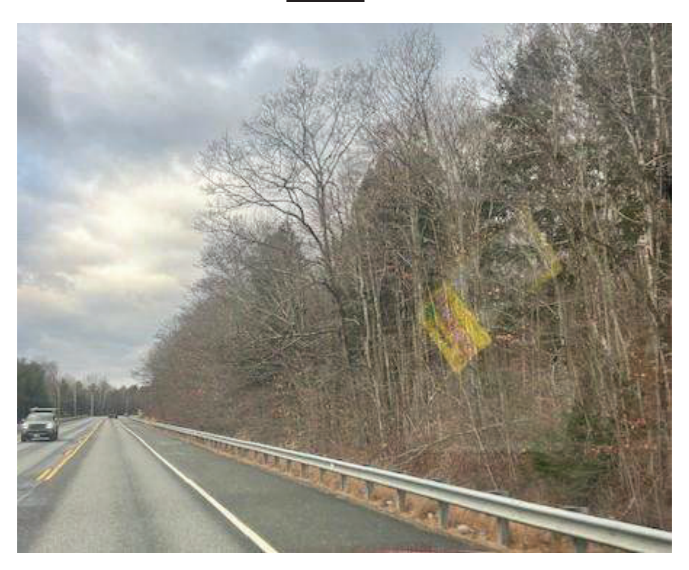
Existing Woodland Buffer from NH Route 9, Looking West December 12, 2024