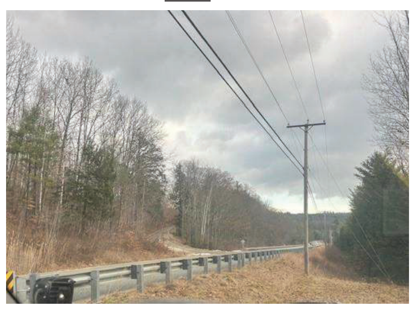
Existing Site Entrance from NH Route 9, Looking East December 12, 2024