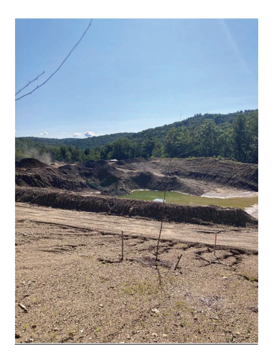
Looking at Current Gravel Operation August 3, 2024