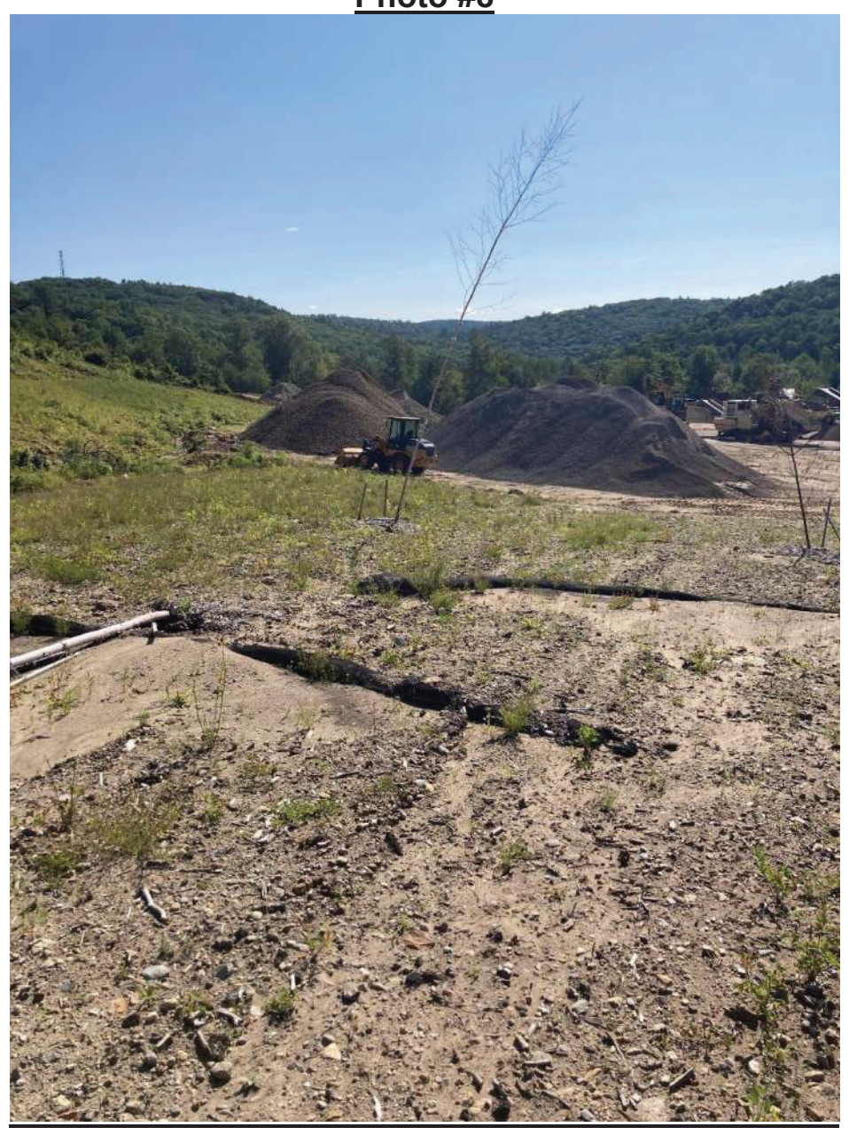
Current Landing Area – 2023 (Area Since Stabilized) August 3, 2024